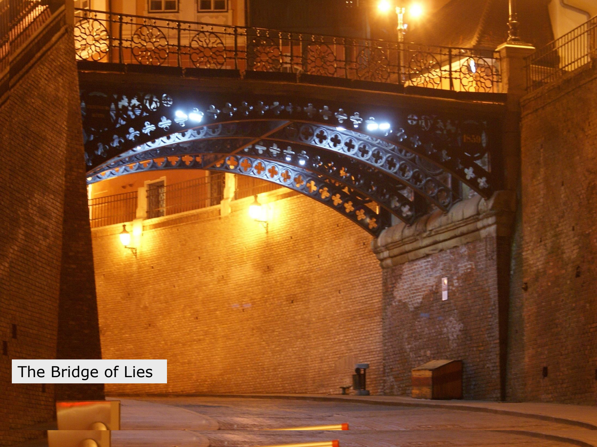
The Bridge of Lies