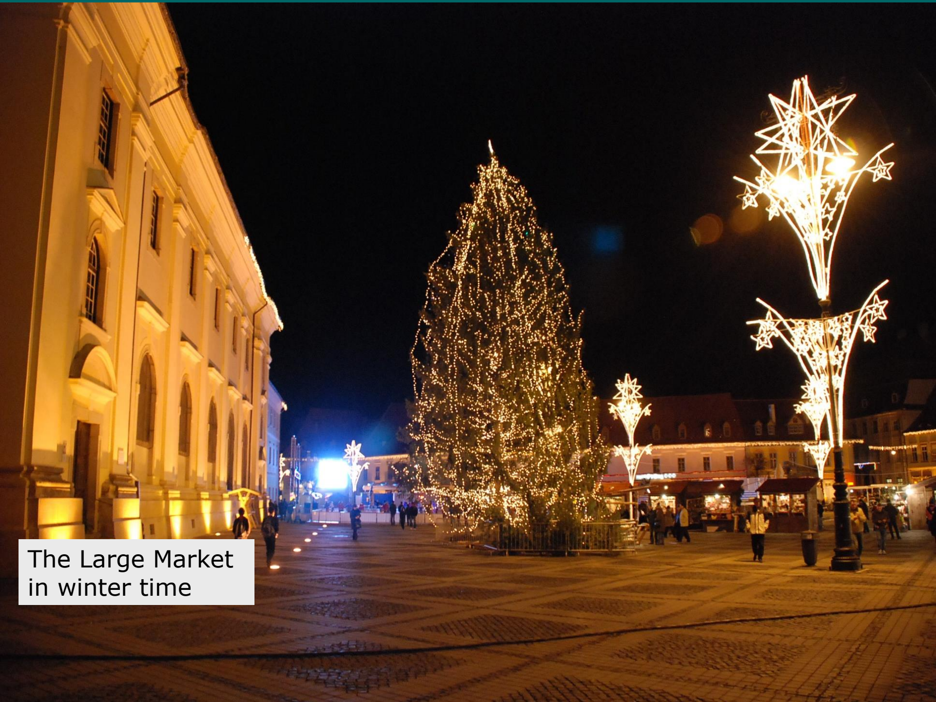
The Large Market in winter time